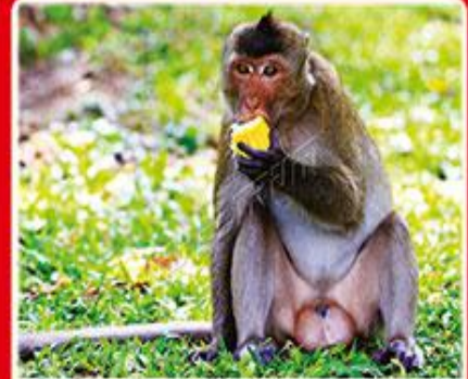
બંદર MONKEY વાંદરો