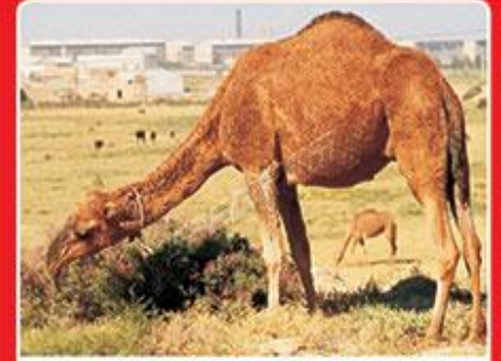
उंट CAMEL Eats Grass & Leaves उंट