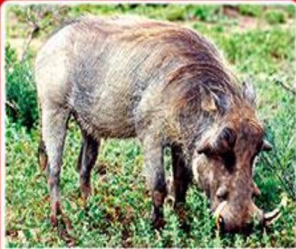
સુઅર WARTHOG જંગલી સૂવર