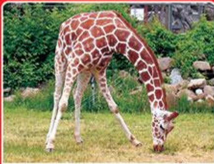
जिराफ GIRAFFE Eats Grass & Leaves जिराफ