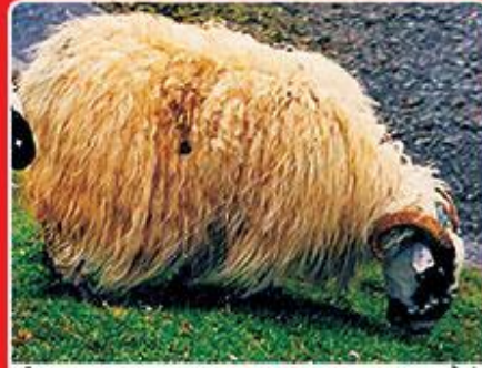
भेड़ SHEEP Eats Grass भेड़