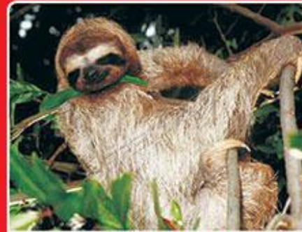
स्लोथ SLOTH Eats Leaves स्लोथ