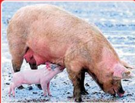
सुअर PIG Eats Grass Hay ,Fruits & vegetables सुअर