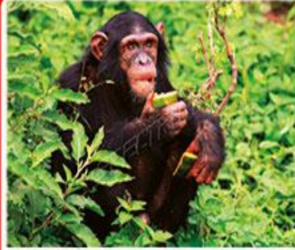
ચિમ્પાન્ઝી CHIMPANZEE ચિમ્પેન્ઝી