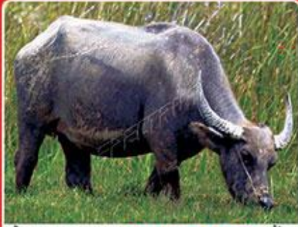
भैंस BUFFALO Eats Grass & Fodder भैंस