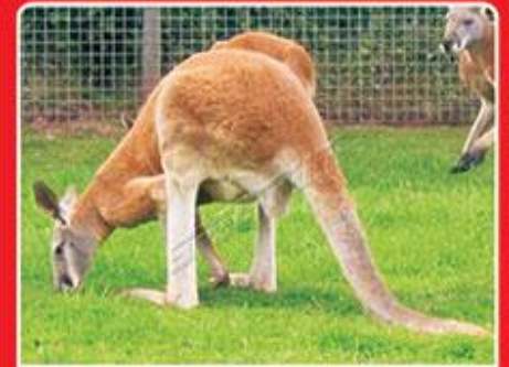
कंगारू KANGAROO Eats Grass कंगारू