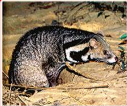
ગંધ માંજર CIVET જખાદી બિલાદી