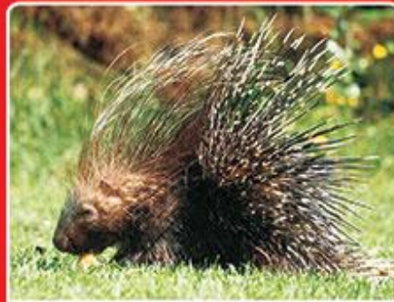
शल्यक (साही) PORCUPINE Eats Grass शाहुडी