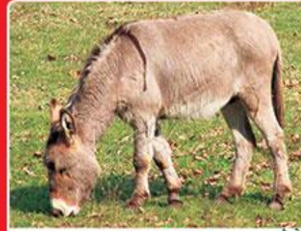
गधा DONKEY Eats Grass गधेडी