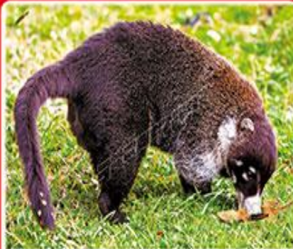
કોઆટો COATI કોઆટી