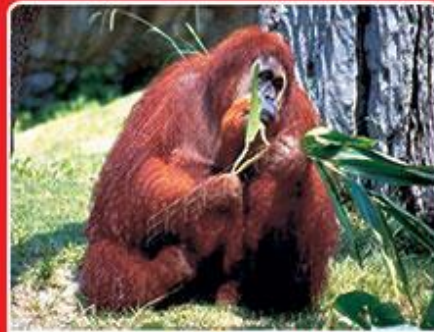
ओरंगउटान ORANGUTAN Eats Leaves & Fruits ओरंगउटान