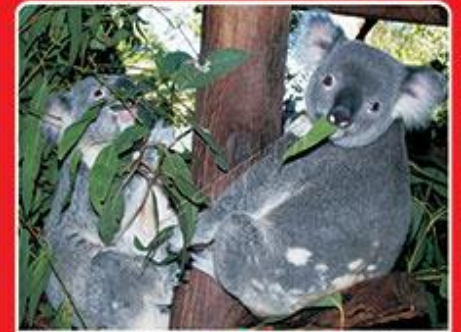
कोआला KOALA Eats Leaves कोआला