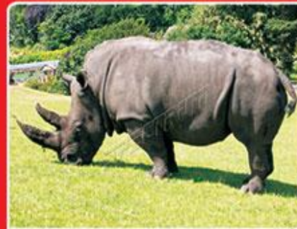
गैंडा RHINOCEROS Eats Grass गैंडे