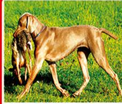
કુત્તા DOG કૂતરો