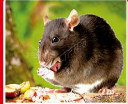
ચૂંહા RAT ધૂંસ