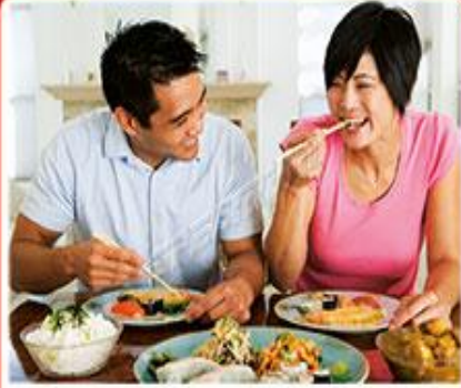
મનુષ્ય HUMAN મનુષ્ય