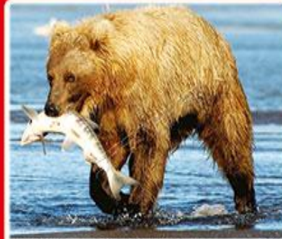
માલુ (રીઠ) BROWN BEAR રીંછ