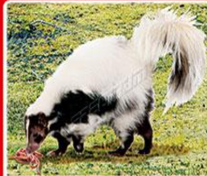
સ્કન્ક SKUNK સ્કન્ક