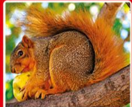
ગિલહરી SQUIRREL ખિસકોલી