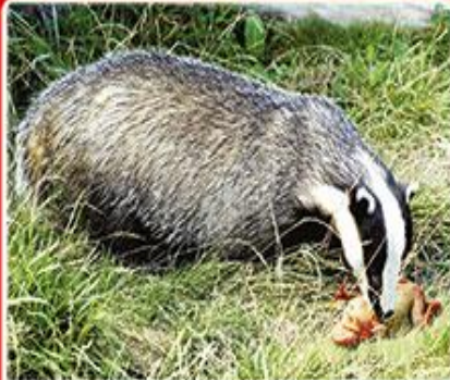
બેજર BADGER બેજર